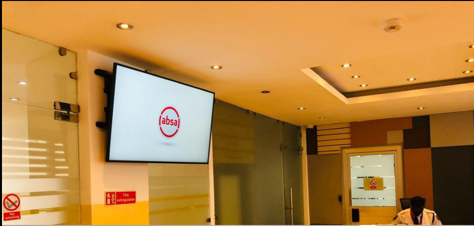
iamadinkra . #absa_installation