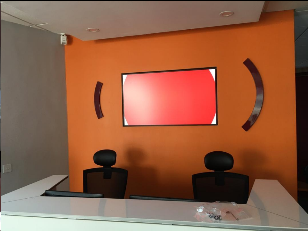
KPST, Adum - Kumasi iamadinkra